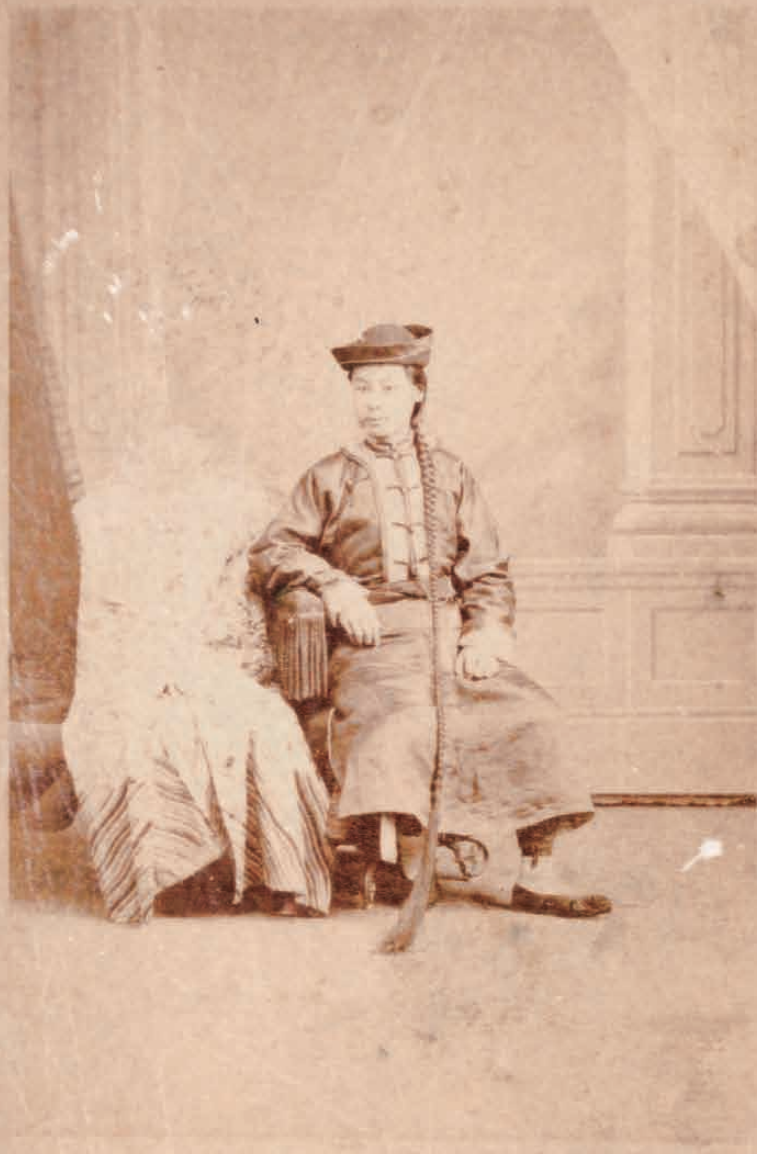
Wong Chin Foo, circa 1870.

Reproduced with permission from the collections of Special Collections/ University Archives, Ellen Clarke Bertrand Library, Bucknell University, Lewisburg, Pennsylvania.